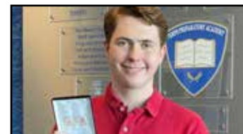
Congressional winner, See inside

APRIL 2025 • VOL. 54, NO. 699 • DRIVEWAY DELIVERED IN THE LAKES SINCE 1972 • WWW.THELAKESOFTEMPE.COM