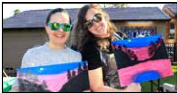
Painting in the Park, See inside